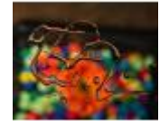
Beauty Is in the Eye of the Beholder Kimberly Scott Third Place